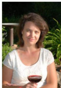
VIRGINIE BOONE @vboone